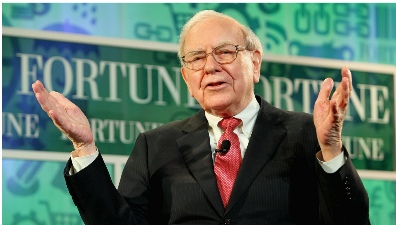
Warren Buffett.

BY CARMINE GALLO, KEYNOTE SPEAKER AND AUTHOR, 'FIVE STARS: THE COMMUNICATION SECRETS TO GET FROM GOOD TO GREAT' @CARMINEGALLO