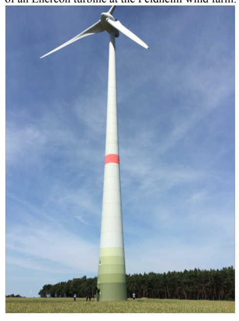
Figure 2. CREATE Participants enter the base of an Enercon turbine at the Feldheim wind farm.