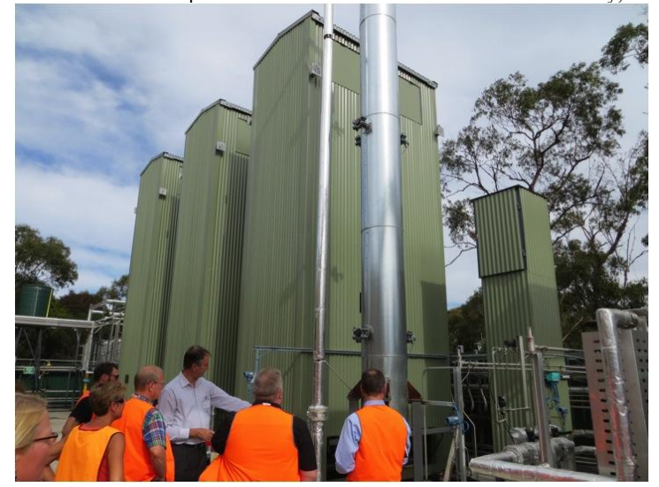
Figure 1. CREATE Participants view the Licella biofuel reactor in Somersby, Australia.