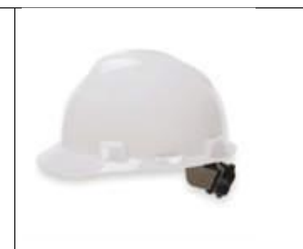
Hard Hat – Bashlin ME3 w/M94 chin strap Meets ANSI Z89.1 standards – Type 1, Class C

(Prescription if needed or safety glasses that cover your prescription glasses. Safety glasses must meet ANSI Z87 standard)