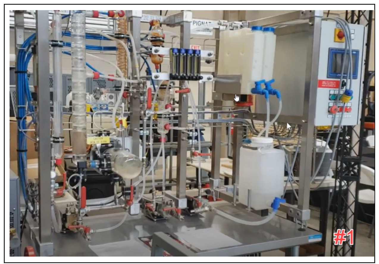
Distillation System training unit at South Ark CC.