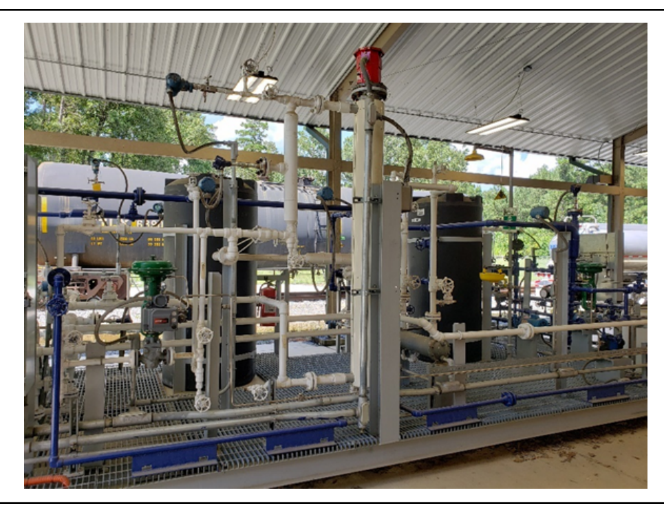
HOT Skid training unit at South Ark CC.

Can design multiple simulations in Automation studio that will have the students perform the same functions online, as they are doing in the Hands-on Activities in the lab.