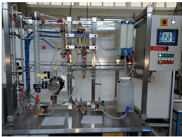
Distillation Training Unit