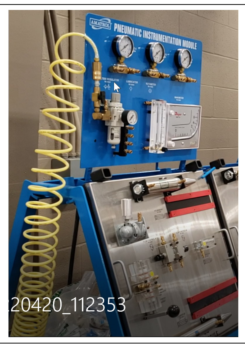
Pneumatics Training Unit at South Ark CC