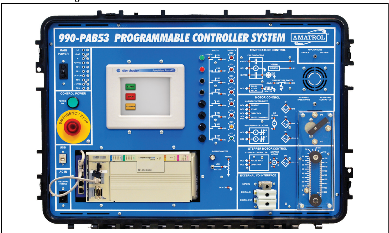
PLC Training Unit at South Ark CC