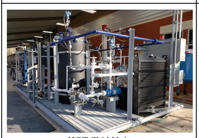
HOT Skid Unit