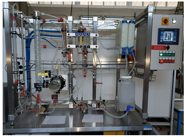
Distillation Training Unit