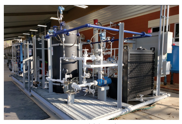
HOT Skid Unit