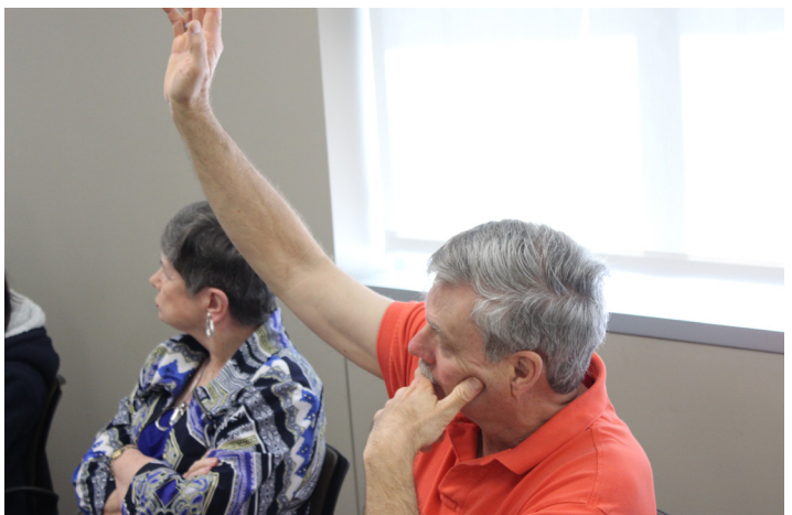
In the photos above, BILT members in the room raise their hands to vote on each KSA item in real time-the electronic voting method eliminates the need for hand votes.